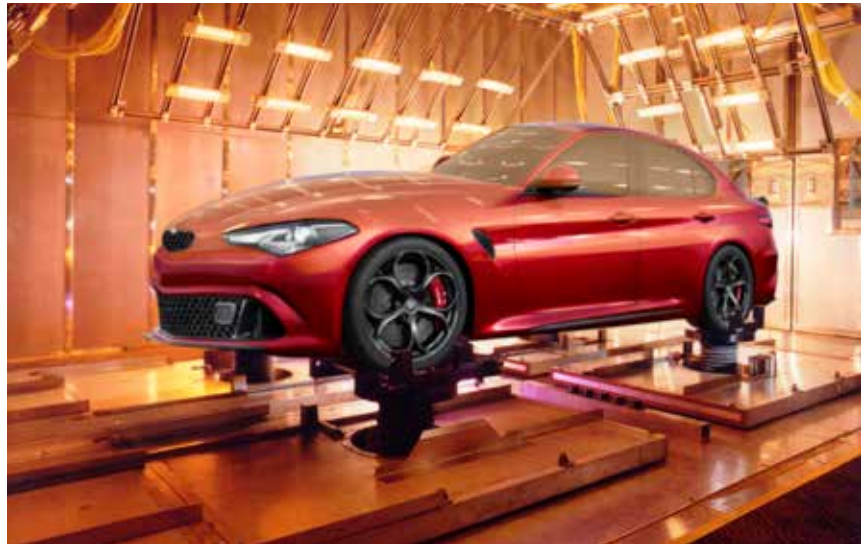
Four post road simulator with temperature, humidity, vibration and solar simulation.

Testing procedures include noise, vibration, climate conditions, suspension systems, shocks, squeaks and rattles. Every chamber can be tailor-designed to meet different requirements and specifications and can integrate with vibration systems.