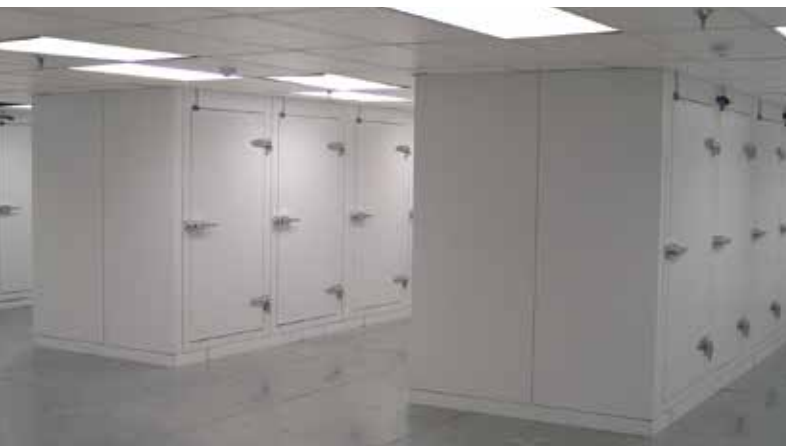
BioStore Freezer Rooms

These Freezer Rooms consist of hallways with multiple freezer compartments on both sides. Ideal for large capacity storage to replace upright freezers with a single unit.