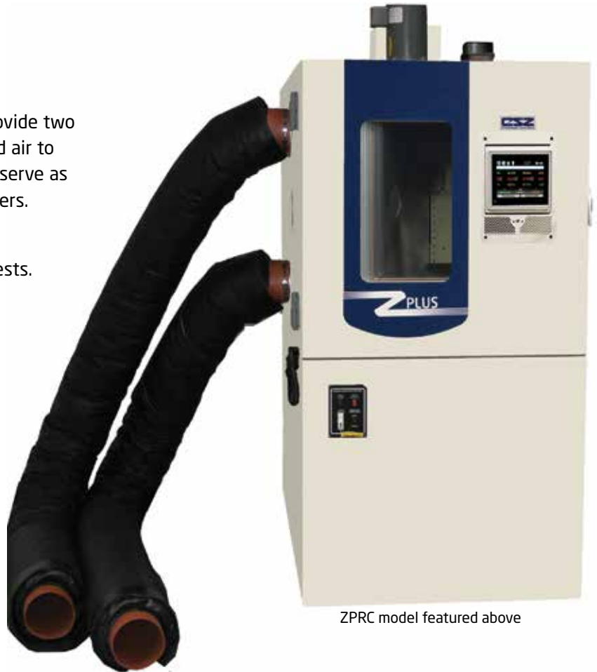
ZPRC model featured above